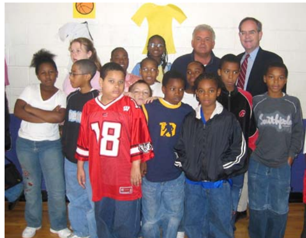
U.S. Rep. Jim Cooper visited the Donelson Middle School in October 2004.

to have the new sign up by the end of the spring term.