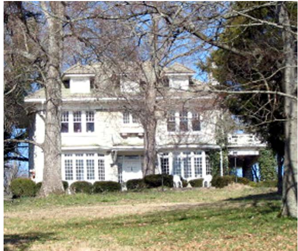
Stone Hall is a Colonial Revival-style residence built atop a hill overlooking Stones River in 1918. The property features historic gardens as well as outbuildings, sheds, and barns. This is the front of the beautiful house as seen from Lebanon Pike.

With help from a $400,000 grant from the Tennessee Department of Environment and Conservation, $300,000 raised by Greenways for Nashville in private donations from people who care about Nashville’s history and green spaces, $475,000 in Metro Parks land acquisition funds and transportation funds through the TDOT, the goal was reached and the property saved!