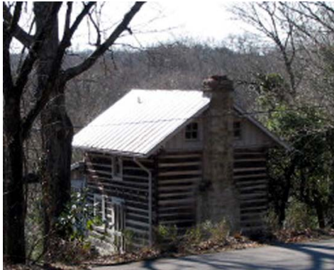
The Eversong log cabin is a familiar sight from the Stones River Bridge along Lebanon Pike.